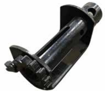
Web Cable Winch