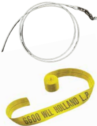
Winch Wire & Webbing

Contact our sales team for specific lengths / configurations to meet your needs