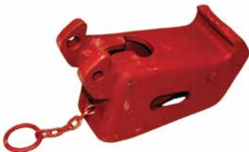
Stake Pocket Anchors

Contact our sales team for specific lengths / configurations to meet your needs