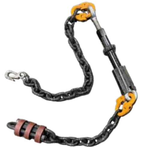
Tie Rod Chains

Contact our sales team for specific lengths / configurations to meet your needs